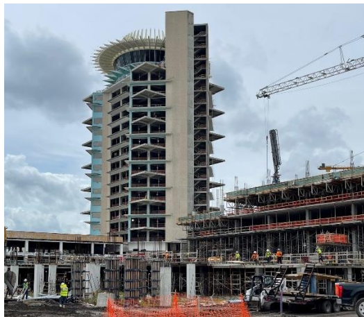
Photo of Existing Site

The property, historically known as Pier 66 Marina and Hotel, is important for its historic associations with the Phillips Petroleum Company. After World War II, the Phillips Petroleum Company was at the forefront of the petroleum industry and began a nationwide marketing and expansion program. By the late 1950s, the Phillips Petroleum Company developed and tested a new logo and a new gas station architectural style that featured a V-shaped canopy. One of the first gas stations was tested in Fort Lauderdale, Florida at Pier 66. Established in 1955 by the Phillips Petroleum Company, Pier 66 began as a yacht marina with a fueling dock and boat service facility as well as an automobile service station, both completed in 1956. At the onset of the project, the Company announced their intentions to construct a motel, and restaurant and yacht club building. The Pier 66 Restaurant and Lounge was completed in 1957. Shortly after, plans were underway for the 102-room Motor Hotel (1958-59) and 9-hole, par-3 golf course, swimming pool, restaurant, and other amenities. The success, rapid development, and reputation of Pier 66 Marina, Restaurant and Lounge, and Motor Hotel necessitated more rooms and meeting facilities. In 1963, Phillips Petroleum Company announced the development of the Pier 66 Hotel Tower, a unique 19-story concept that added 160 rooms to the existing 102-rooms.